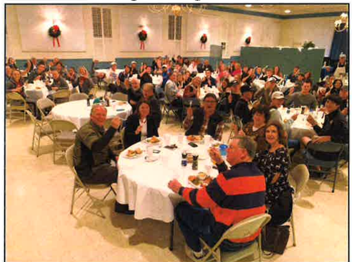
CMF fed 60 MSU athletes plus 20+ from the Neighborhood on Wednesday, December 5 th .