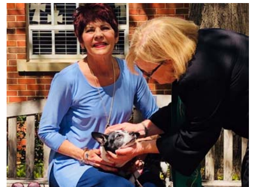
Blessing of Animals – April 28

First Christian Church has set aside two Saturdays this month to demonstrate our gift of hospitality. On April 21 we will host the ninth annual Cruisin' for Christ Car Show, gathering in car enthusiasts from across Texas and beyond. The following Saturday we will welcome animal lovers in our community to our first annual (we hope) Blessing of the Animals.