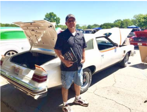
Cruisin' For Christ Kick Off Car Show – April 21