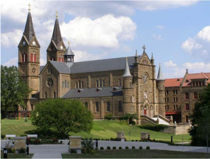
St. Meinrad Archabbey.