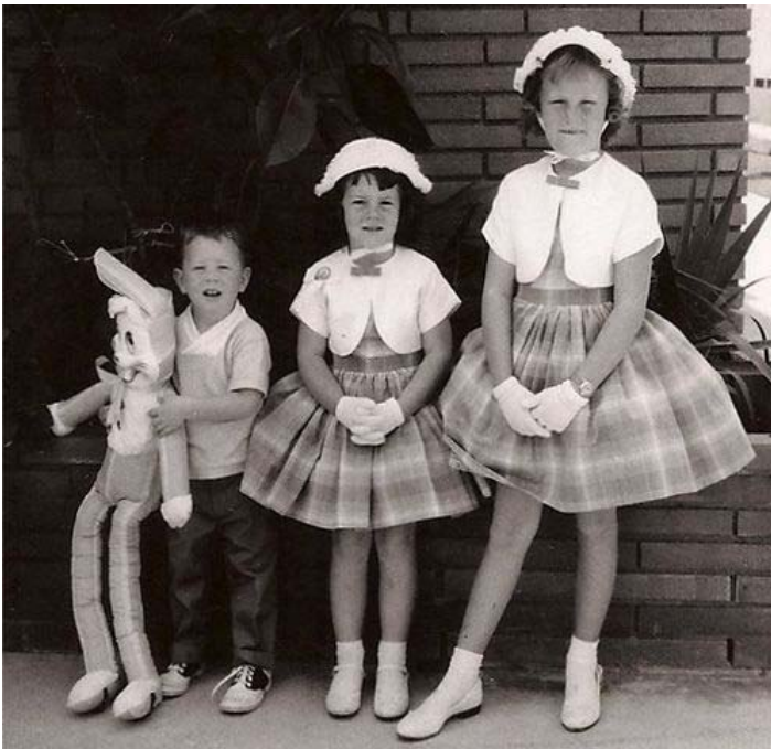
I don't have a photo of myself wearing my new shoes and Easter hat. But I'm sure these girls were uncomfortable, too.