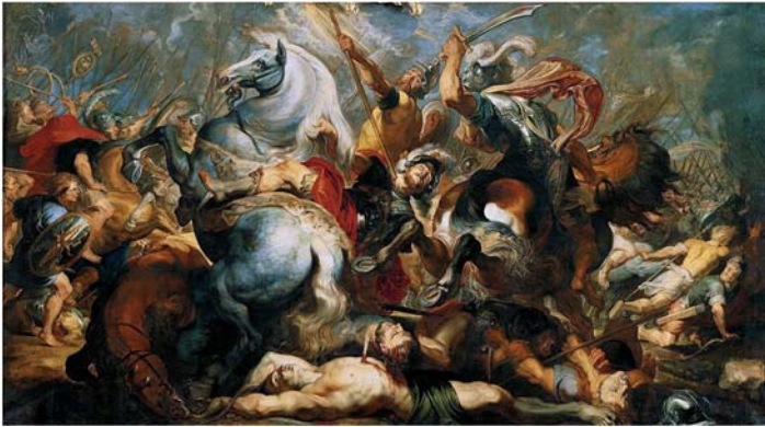
The Death of Decius Mus in Battle, by Rubens, 1618