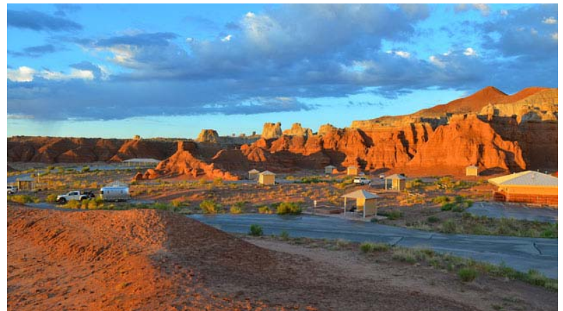
Overnight camping space is limited in this remote park. We're lucky Ben and Hailey made the reservations early. The campsites are located alongside a spectacular rock formation.