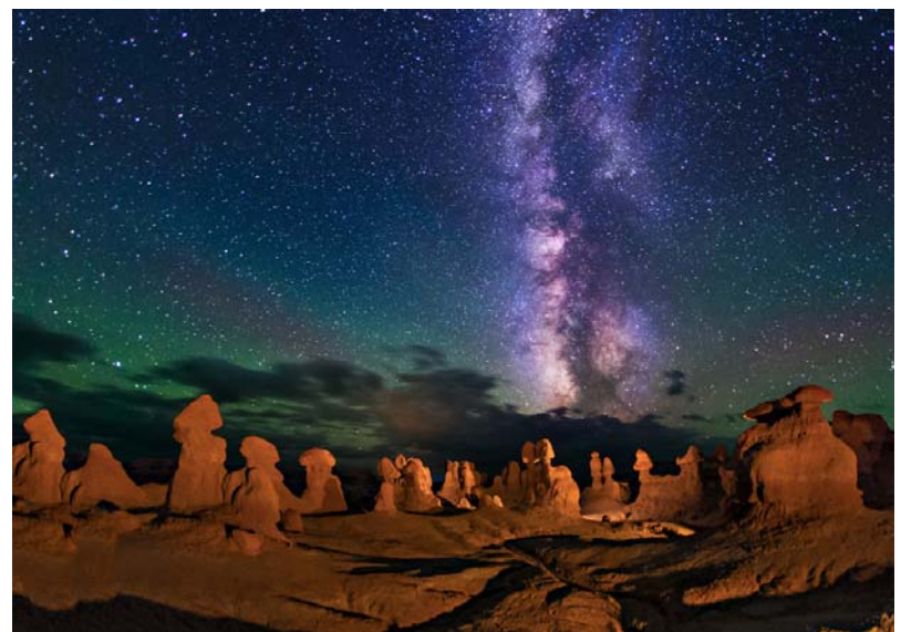
My simple camera is not capable of this advanced photography. So enjoy the night sky over Goblin Valley as captured by a real photographer!