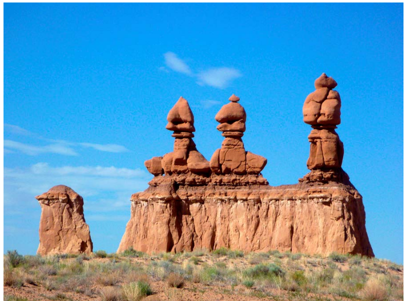
These three sandstone formations are like the deacons of Goblin Valley State Park, standing near the entrance to greet guests.

The heavens proclaim God's righteousness, says the psalmist. That night we were reminded of God's glory. The Lord is King! Let the earth rejoice!