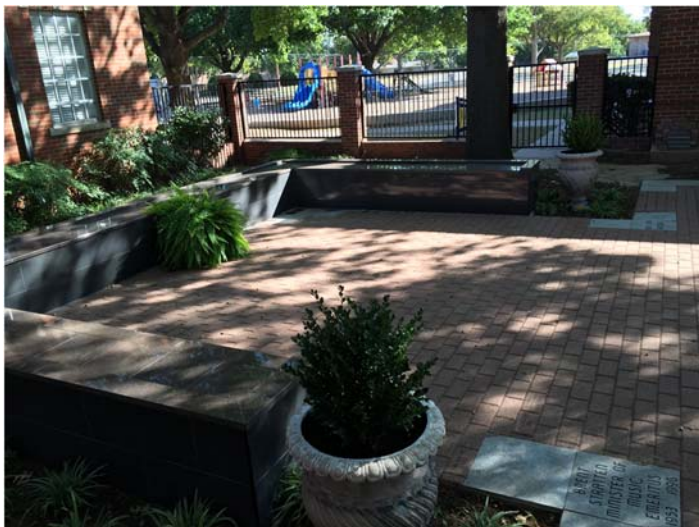
Dedication of the First Christian Church Columbarium October 18, 2015

Note: The following is adapted from the message given at the dedication for our Columbarium in the Garden of the Cross, done in the 125th year of the life of First Christian Church of Wichita Falls.